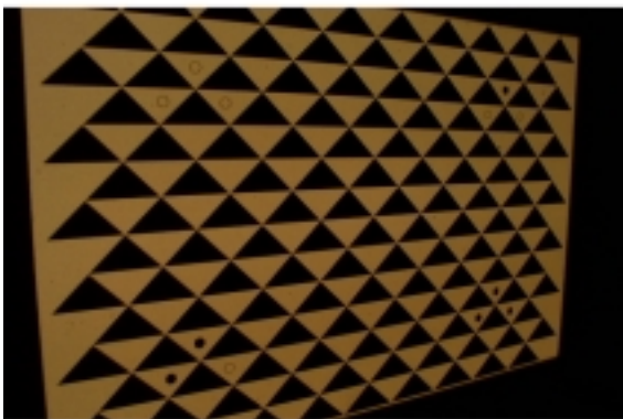
Figure 2a: Eos' Standard Calibration Grid

The accuracy of a photogrammetric measurement system will be largely determined by the accuracy of the images produced by the digital camera. The physical and optical characteristics of the camera have to be accurately quantified to allow PhotoModeler to use the image data for measurement. The quantification of the camera parameters is a process called camera calibration.