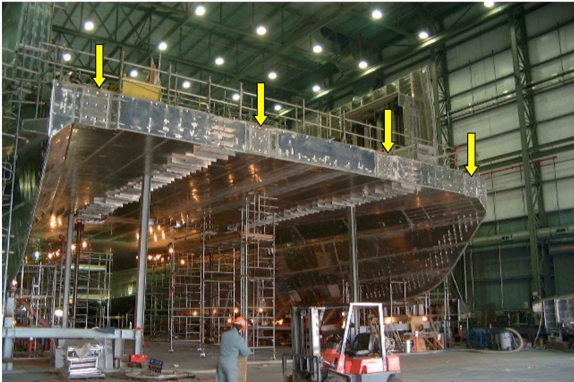
Figure 1: Bow of the Ferry prior to the installation of the Bow Ramp, (arrows at hinge locations).

The project involved a real-world industrial measurement task in the shipbuilding industry. This was not a “laboratory” study but instead conducted in a real production environment. The targets used to measure coordinate points were not chosen to satisfy the photogrammetry technique but were in fact part of the established production process.